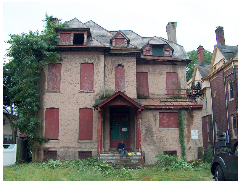
EXISTING EXTERIOR VIEW (GREENWOOD AVE.)