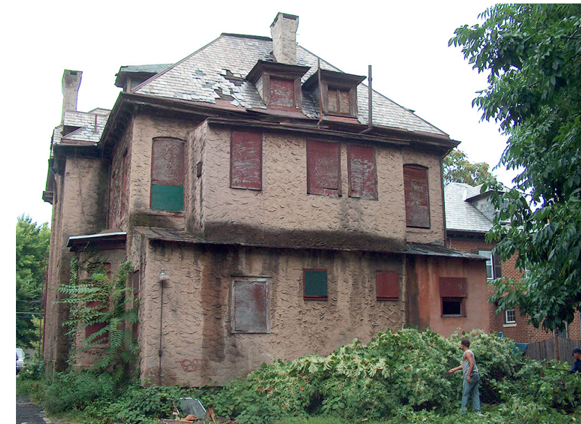
EXISTING EXTERIOR VIEW (REAR - PARKING)